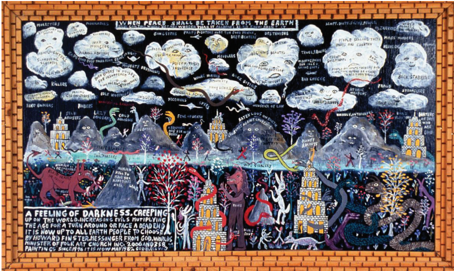
FIGURE 4 | Howard Finster, A Feeling of Darkness , 1982. Tractor enamel on wood, 21 x 34 in. (52.7 x 86.4 cm).