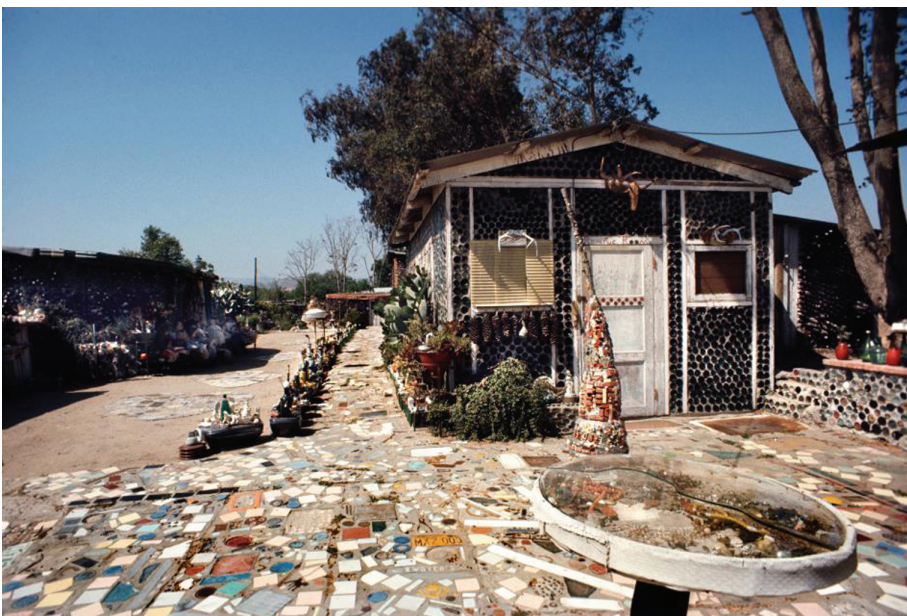
FIGURE 3-2 | Mosaic tile walk way and the Rumpus Room house at Tressa Prisbrey's Bottle Village, Simi Valley, California.