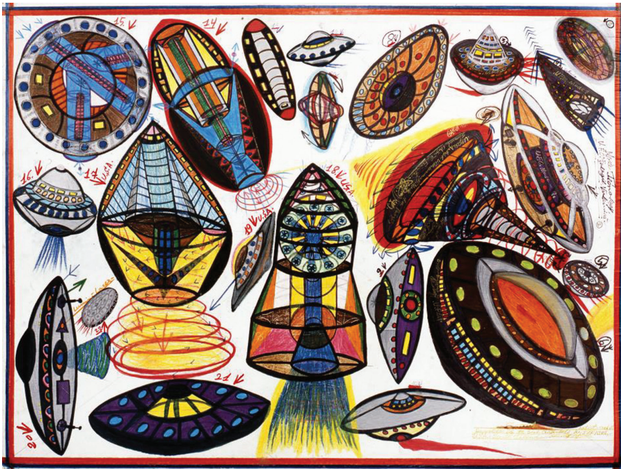
FIGURE 5-1 | Ionel Talpazan, Future UFOs Diverse Diagram: 22 Modele Advanced Extra Terrestriale Tecnology for Planeta Earth , 2000. Oil crayon, marker, pencil and ink on paper, 30x40 in. (76.2 x 101.6 cm).