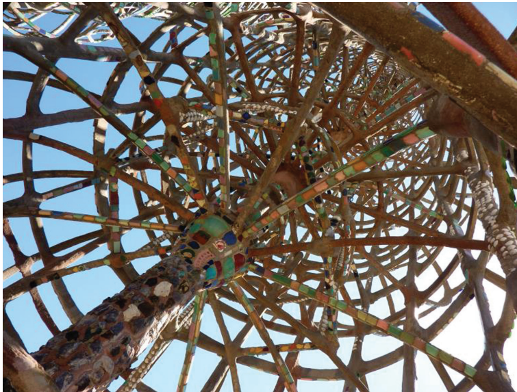
FIGURE 2-1, 2-2 | Sabato Rodia's towers and mosaic work on the south exterior wall and interior of his structures.