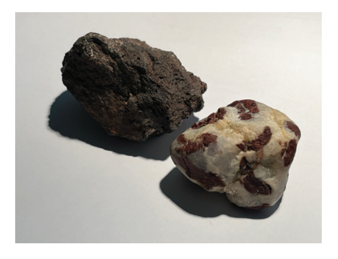
FIGURE 2 | The stones from Epidaurus. Photo, Vivien Marcow Speiser Feb. 27, 2024.

When we arrived in Greece, in search of understanding and invoking inspiration, we travelled to the mountains and endless vistas of the Peloponnese and visited the sanctuary of Asklepios in Epidaurus, an early theater used also for healing, established in the 4th century BC (see Figure 3). This theatre has withstood the shocks of the planet and divine and human intervention since that time. We marvel as we hold the stones from this place in our hands, as we have done with objects we have gathered from other powerful sources, as we source their energy (see Figure 2). We begin to understand that we ourselves are engaged in a process of healing and regeneration as we embark on this journey, and we begin to gather new experiences and resources to support us in our lives and in our work.