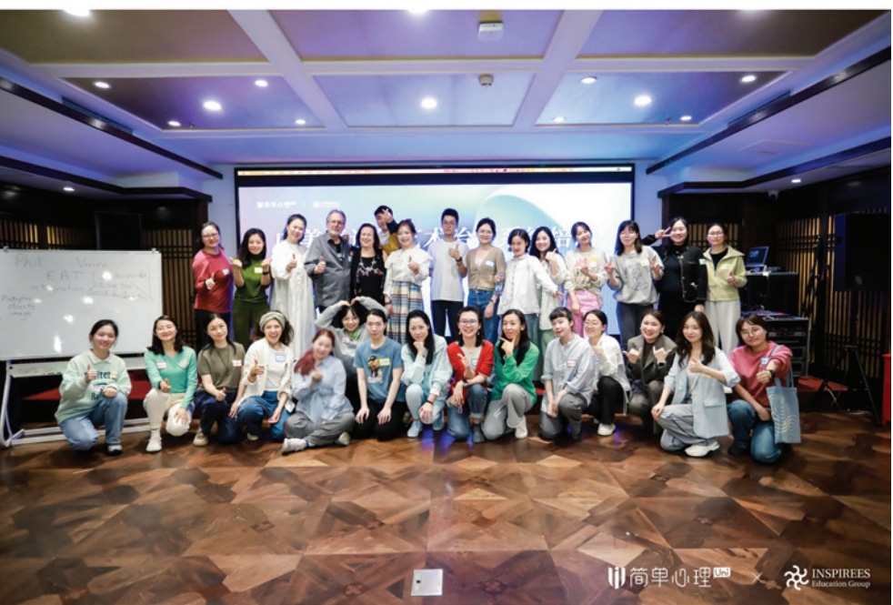
FIGURES 10 AND 11 | The first Inspirees Expressive Arts Therapy group inaugurates the training program, April 2024. Photo, Inspiree, April 19, 2024.