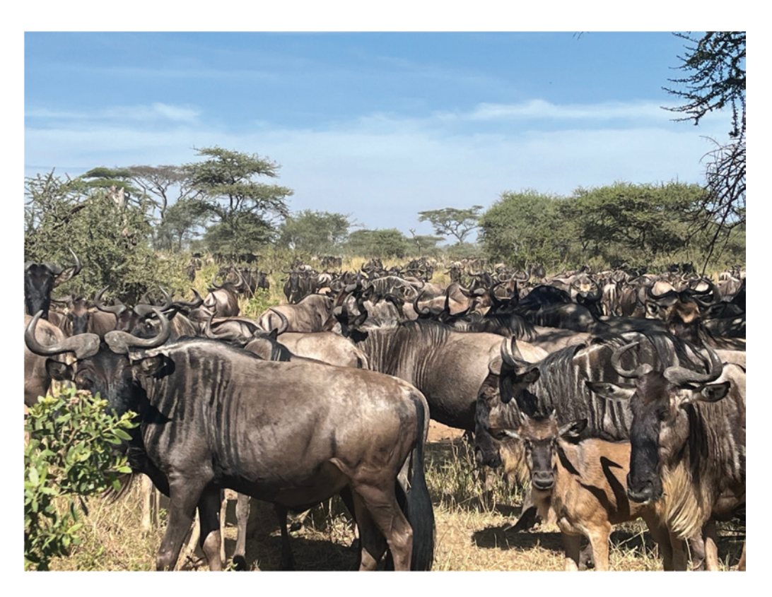
FIGURE 6 | Vivien and Phillip traveling through the middle of the great herd migration. Photo, Phillip Speiser, March 29, 2024.

From Zambia, we fly to Tanzania where we will witness the great herd migration where hundreds of thousands of mostly zebra and wildebeest cross annually from Kenya down to Tanzania for half the year, where they birth their young, and those that survive then make the trek back north (see Figure 6). These vast migratory herds are always searching for the best food and water in this never-ending circulatory journey where they are themselves encircled by predatory beasts as they attempt to protect their young and stay alive themselves. It is a curious moment where we are, taking respite from the wars by bearing witness to an essential search for survival in the animal kingdom. We become tourists as part of the herds of tourists in the Serengeti park, who encircle the animals engulfed in this migratory pattern. We too are trying to survive the danger to the human species posed by conflict, war, and ecological threats. We are finding here that nature re-sources us, and we feel the magnitude of the connection to the whole of creation—in the constant changing vista of nature's unfurling its treasures as it soothes