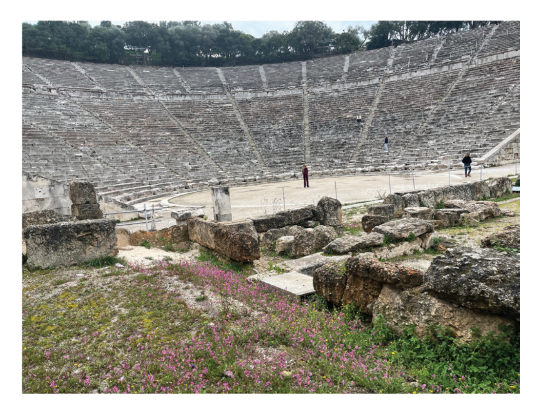
FIGURE 3 | Phillip standing in the still existent ancient theatre in Epidaurus. Photo, Vivien Marcow Speiseer Feb. 27, 2024.