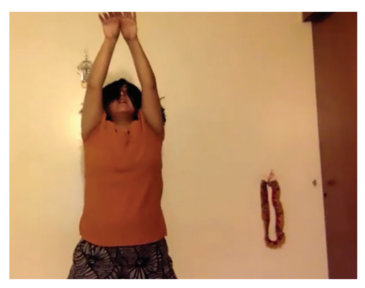
FIGURE 10 | The end of the fairytale.

After the fairytale, dances, and music ended, one of the storytellers shared that he trusted that the flow was going somewhere. The other storyteller shared that she felt "the fairytale, movement, and music really went together and completed something." A dancer shared that through dancing she felt that "the earth has really suffered in the past few years." Another dancer shared that when she heard that the gods and goddesses did not know what would happen, "In my own story, the gods and goddesses were not the ones in control. And that for me was very powerful and very freeing." These feelings of satisfaction, completeness, compassion, power, and freedom transformed the initial uncertainty and worry.