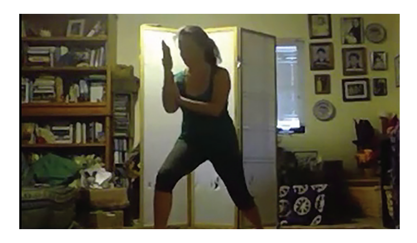
FIGURE 2 | A solo dance about the anxiety of what the crisis will bring.