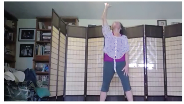
FIGURE 7 | The beginning and end of the solo dance.

The group members who did attend the meeting noted that this fairytale fit with their situations, as they felt they were unable to leave their work, family, or community situations. The members acknowledged that this effort came at a personal emotional cost for them, as their employers, community, and political leaders work did not appreciate or support the complexity and difficulty of their experience. However, they felt their commitments to their community responsibilities remained of value to themselves.