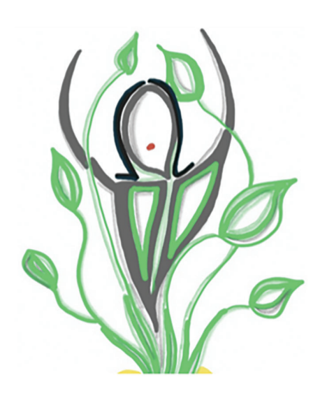
FIGURE 6 | The dance of the future and art and poetry response.

Embrace The energy, use it, dance with the moon and the stars and rest in the sun. Hold your life dear.