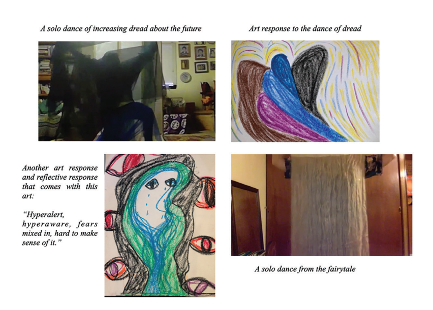
FIGURE 3 | Pictures and artwork from the fear of the unknown.

A second dance improvisation followed in response to a story from a participant as she described a feeling of increasing dread and anxiety from her sense of the beginning of crisis in Europe.