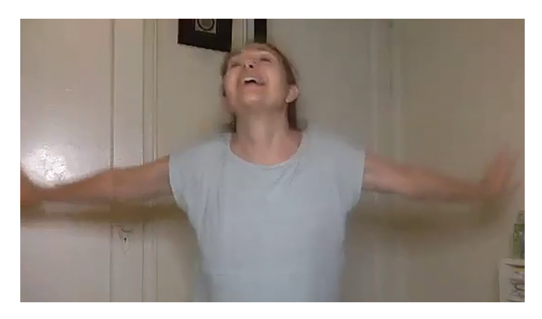
FIGURE 1 | One of the dances from the fairytale.