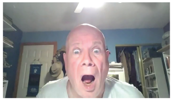
FIGURE 4 | Who are we behind the masks?