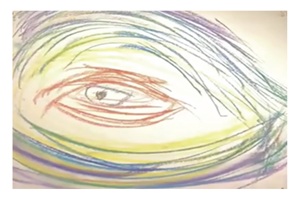
FIGURE 8 | Art of the initial storyteller who presented the story of thankfulness.