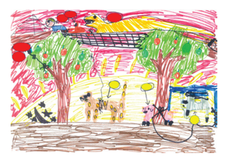
FIGURE 1 | Projection, image, and metaphor in session 7.