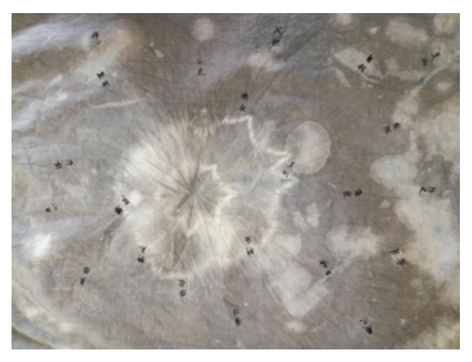
FIGURE 10 | INGRID, 2017: Tie-dye process

I breathe and open my wondering. I realize this bitty and inconsistent image actually feels accurate. I'm no longer only African; I've lived in Scotland, England and in Australia and have now made New Zealand my home. These journeys have both blurred and added to my sense of self as African. I smear the dots with a fingertip. Some blur easily; others resist. This tells stories of the bits of me that have compromised, adapted, grown and transformed while also revealing the stubborn bits that remain fixed, untouchable, or lovingly sustained. I now want to depict my new home and how it speaks to this underlying image. I'm a collection of beads of thought/feeling/experience/inheritance stitched – and being stitched – together again and again on the canvas of self, so I apply my pointillist dotty technique again. Rounded organic shapes sing of the Kiwi ferns – the koru – and swirl in white over the squares and chevrons and triangles of the African beading. The finished piece is rough-edged – like me. The paint, dry in some places, makes the fabric stiff; in other places it allows it to be flexible – just like me. The two very different color – and shape – choices create contrasts, harmonies, discords and enhancements – just like me. I tear the cloth with a little wrench and send my piece to INGRID.