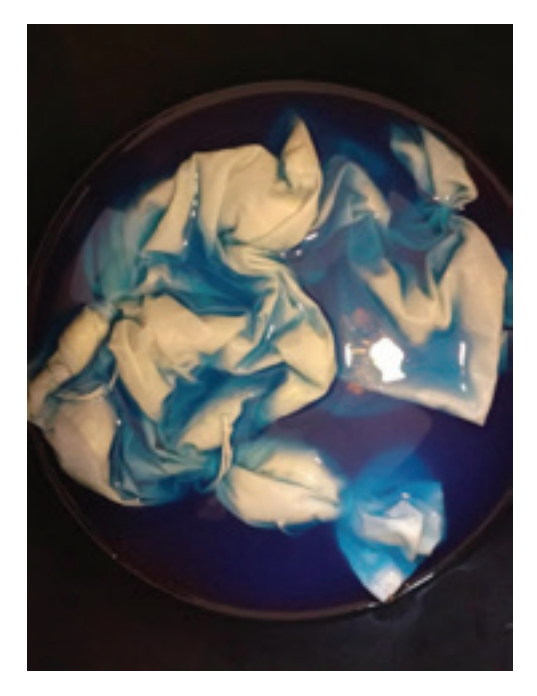
FIGURE 6 | INGRID, 2017: Tie-dye process

characters " \mathbb{R} hei" and " \pm tu" meaning 'black' and 'earth'. Because of the natural compounds used in Chinese ink-making, Chinese ink is quite different from Western ink in its composition and its ability to stand the test of time and exposure to light. The main ingredient of Chinese ink is lampblack; the finest Chinese ink is made from lampblack from burning vegetable oil. This is the reason for the distinctive smell of Chinese ink.