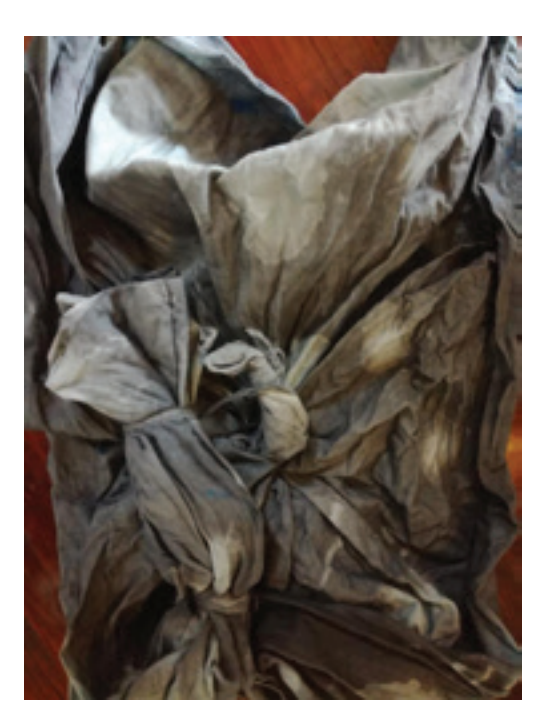
FIGURE 7 | INGRID, 2017: Tie-dye process

table – and beautiful patterns appeared magically. The tied parts of the fabric remained light and stood out in contrast from the color-dyed background. I stood in front of my artwork and felt a mixed sense of relief and happiness. The whole tie-dye process was full of conflicts – ties, knots, and the mixing of different materials – but the results of these conflicts were exciting and refreshing.