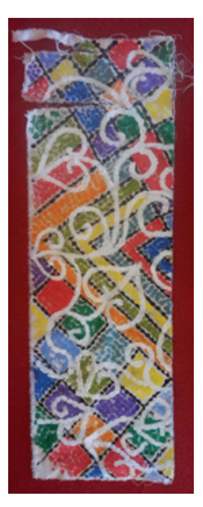
FIGURE 11 | DEBORAH, 2017: Painted fabric

bright, bold colours. The fabric is soft but the layers of colours have made the fabric stiff in some places. I can feel the textures of the dots through moving my fingers lightly over the patterns.