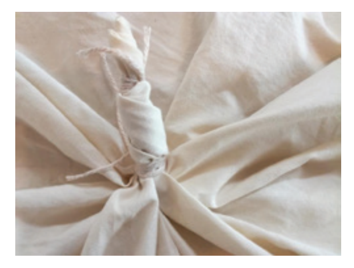
FIGURE 5 | INGRID, 2017: Tie-dye process

In my process of tie-dye making, I mixed Western watercolour with Chinese ink as the dye material. In Chinese writing, the character Ink "墨 mo" is a combination of two