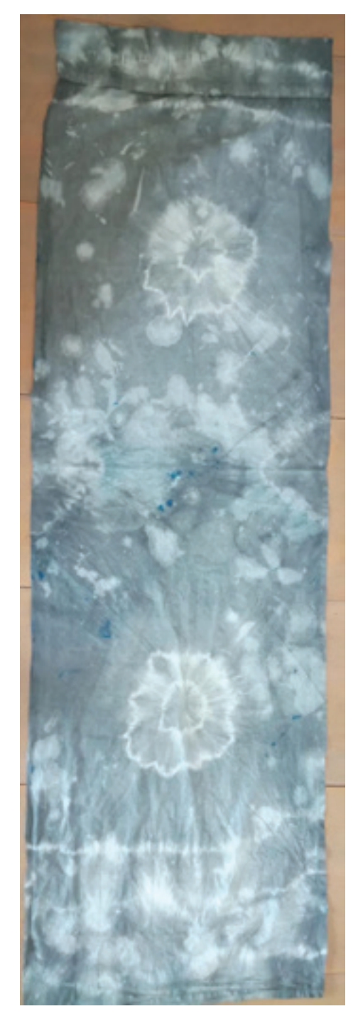
FIGURE 8 | INGRID, 2017: Trace (Chinese Ink and water color on fabric)