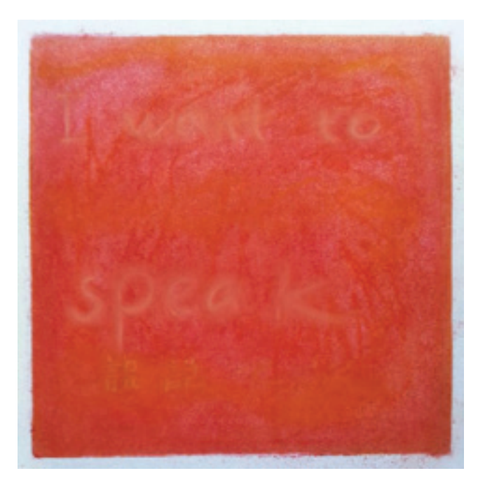
FIGURE 1 | INGRID, 2016: I want to speak (soft pastel on paper, 20cmx20cm). Copyright © 2017 Inspirees International Creative Arts Educ Ther 2017, 3(1)

I love images. This was one of the reasons I became more and more interested in arts therapy. When I make my artwork I do not have my accent in my images. In the artwork I want to speak , I used red to express my anger, frustration and shame at speaking