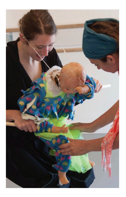
FIGURE 7 | The puppeteer is physically present but additionally made known by the interruption of the "normal" by obvious strings from the head of the puppeteer to the head of the puppet.

between the body as an object of an ideology and the body as an experiencing subject. The phenomenological "lived body" might repair a gap produced by separating the social and intellectual from the physical body. "Providing a phenomenological context proposes a consideration of human bodies who at the moment of performance, do more than perform and are material, tool, subject and source within a singular event" (Sanchez-Colberg & Preston Dunlop, 2010, p. 173).