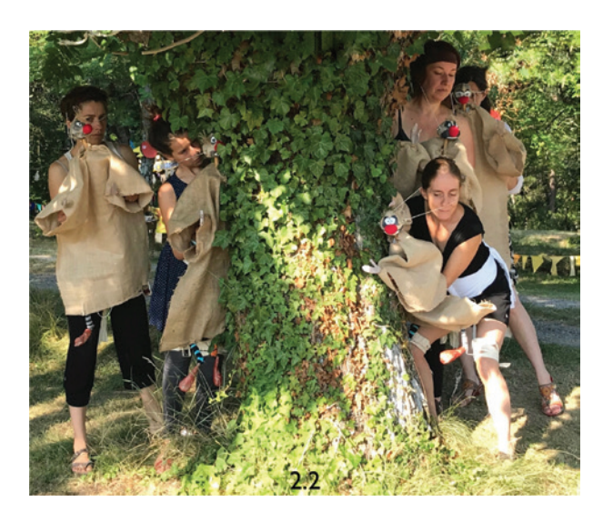
FIGURE 2 | Participants with otome bunraku puppets.