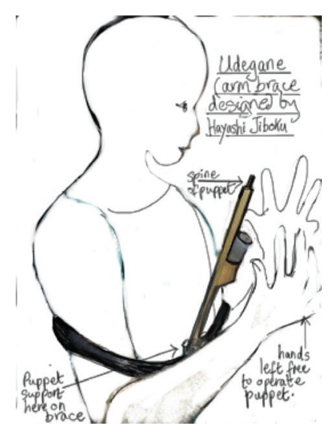
FIGURE 3 | Udegane: a coil of metal twisted around the upper arms of the puppeteer, leaving the lower arms free to operate the hands of the puppet.