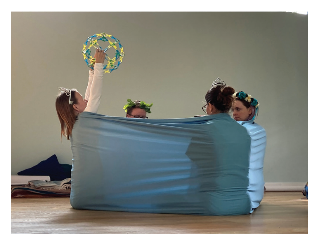
FIGURE 1 | 360 Degree of Witness. Image by Amber Gray.

support these perspectives. Additional information was sought from practitioners in other countries in their regions with whom the authors had personal connections. A questionnaire used to elicit this information is attached as Appendix 1 and the list of respondents as Appendix 2.