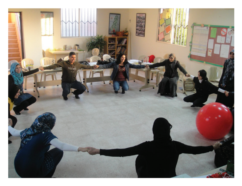
FIGURE 4 | Lebanon DMT activity group. Image by Amber Gray.

© 2021 Inspirees International. Creative Commons Attribution-NonCommercial-NoDerivs 2.0 Generic License