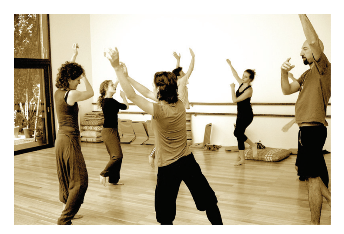
FIGURE 5 | Interbeing through dance.

Many DMT introductory programs are emerging outside of the university system in these countries. These private institutions and organizations have helped to promulgate DMT across South America (Figure 5). Such training programs have attracted students from diverse backgrounds, including dancers, psychotherapists, psychoanalysts, and physiotherapists.