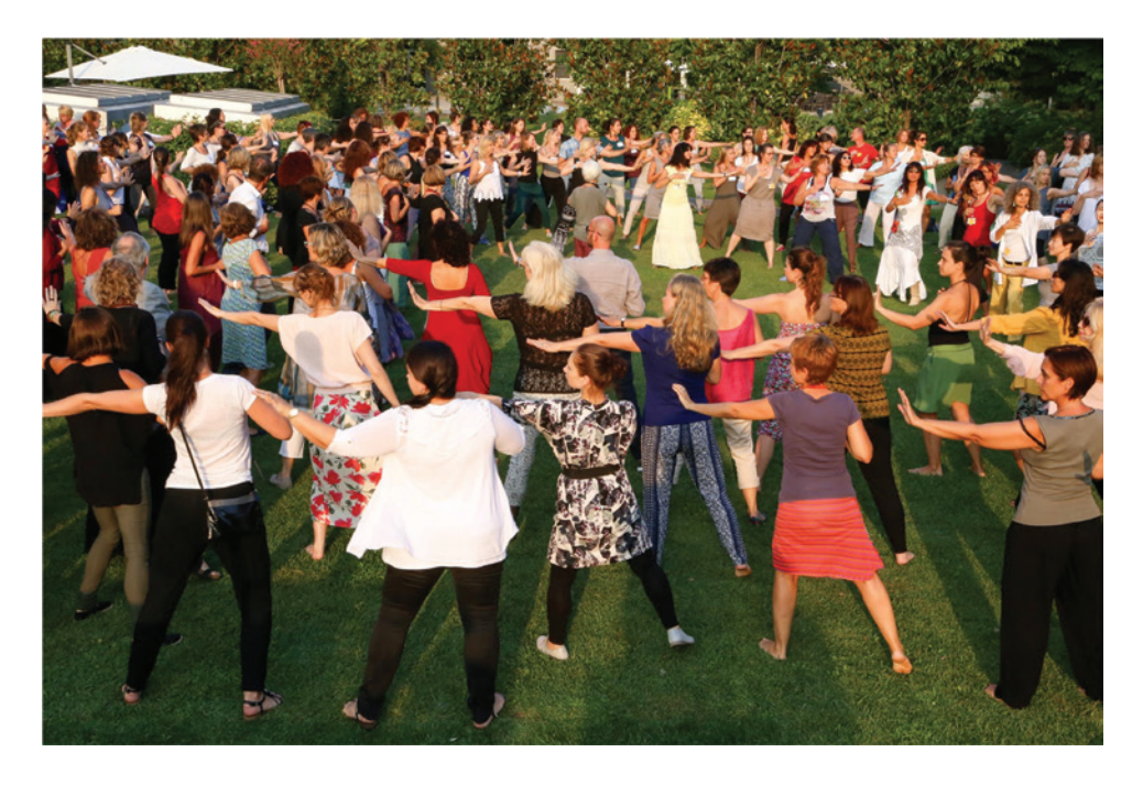
FIGURE 3 | Dance for unity. EADMT Conference, Milan, 2016.