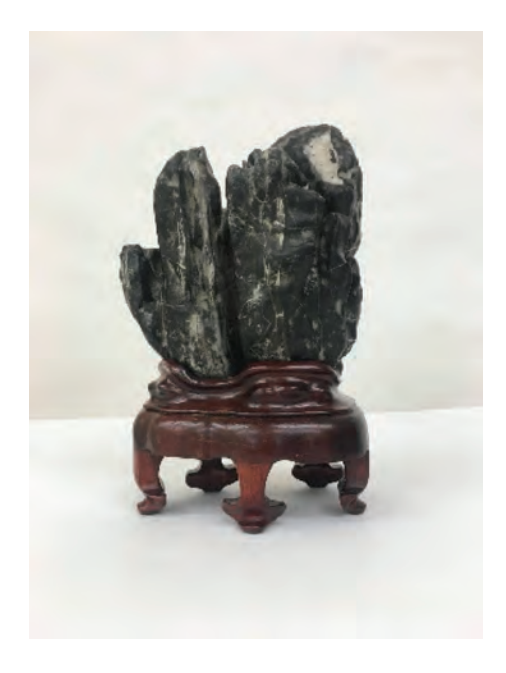
Taihu rock, Kemin Hu Collection.

As a sculptor, the scholars' rocks' appeal is in their visual three-dimensionality. One often reads about the aesthetics of the stones, that the best ones are asymmetrical, with wrinkled surfaces, perforated with holes, resonant when struck, and suggestive of landscapes (Mowry, 2015). I see them as a form of abstract sculpture. They embody the original impulse to elevate a found object to fine art status, not unlike a "readymade," where a commonplace artifact is viewed as art. The odd shapes invite reflection and contemplation. The viewer can see whatever is in the mind's eye—in that sense they are akin to Rorschach ink blots that are used to elicit psychological projections from a viewer's imaginative responses (Smith, 1996). Everyone can relate to finding a beautiful stone, picking it up, and setting it on the desk or windowsill. Recent fads such as "pet rocks," or the idea that the stone is looking back at the viewer, reinforce the ubiquity and chimeric qualities of viewing stones. Rocks are timeless, and universally appealing.