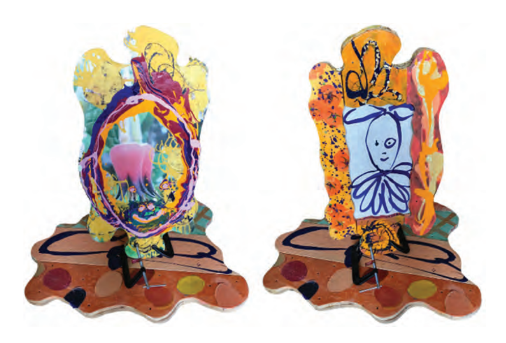
Mark Cooper, Stone Soup IV , (front and back) 2020, ceramic, wood, paint, photographs, ink on paper, and C-clamps.