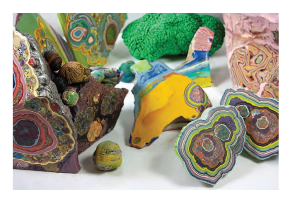
Laura Moriarty, Tableau , 2018/2019. Pigmented beeswax, black sand, metallic pigment, powder charcoal.

fabricated, expressively painted, "anything goes" type of constructions that evoke the display of a rock upon a base. Using unexpected materials such as ceramic tiles, plywood, photography, oil on canvas, resin, and c-clamps, he takes a maximalist approach to this minimalist tradition and the result is greater than the sum of its parts. Teetering between two and three dimensions, the works stare out at the viewer and mirror the viewer in turn.