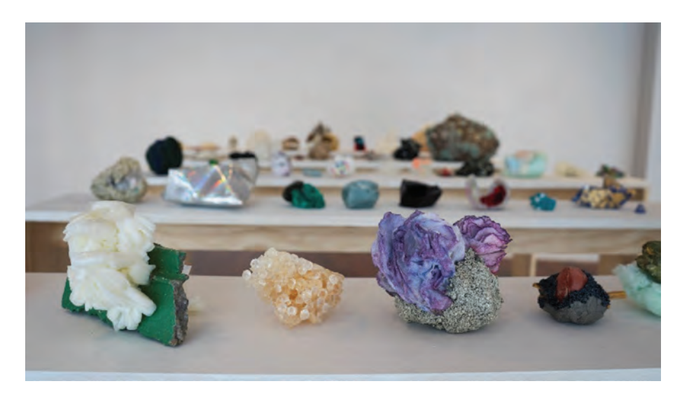
Woomin Kim, Minerals in Use, 2018, mixed media.

believes that there is a natural balance and things are wildly out of balance—swinging out of control on a pendulum.