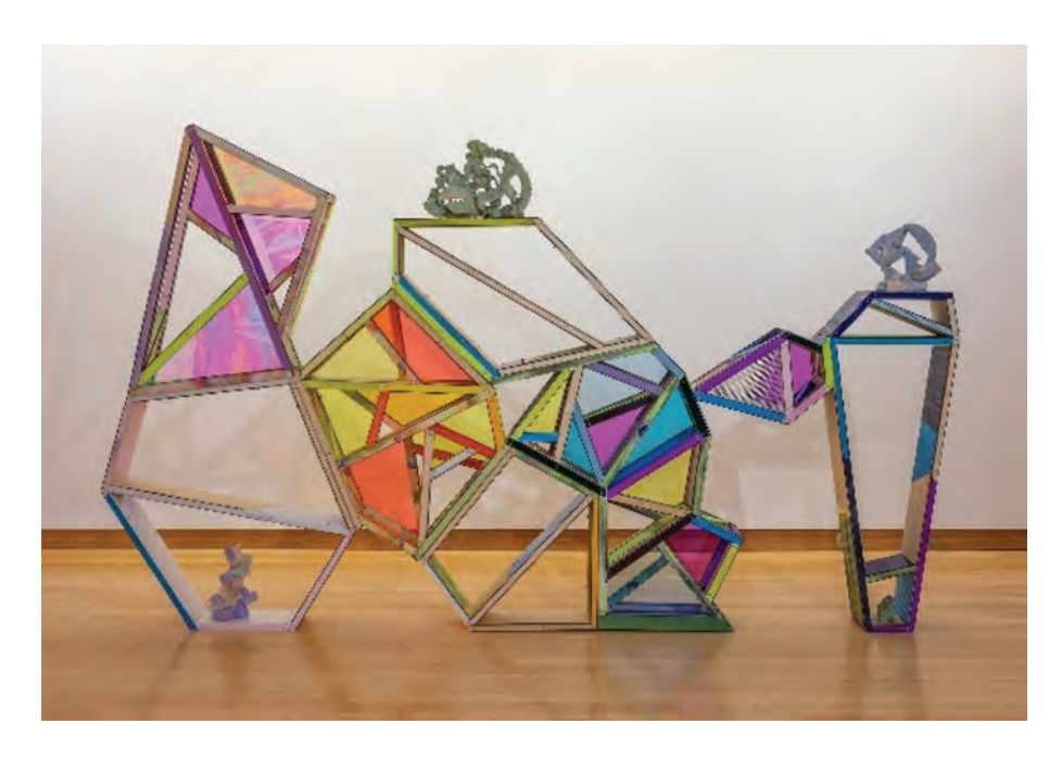
Susan Meyer, Plinth , 2019, wood, acrylic, collage, paint, foam, plaster, wire, and paint.