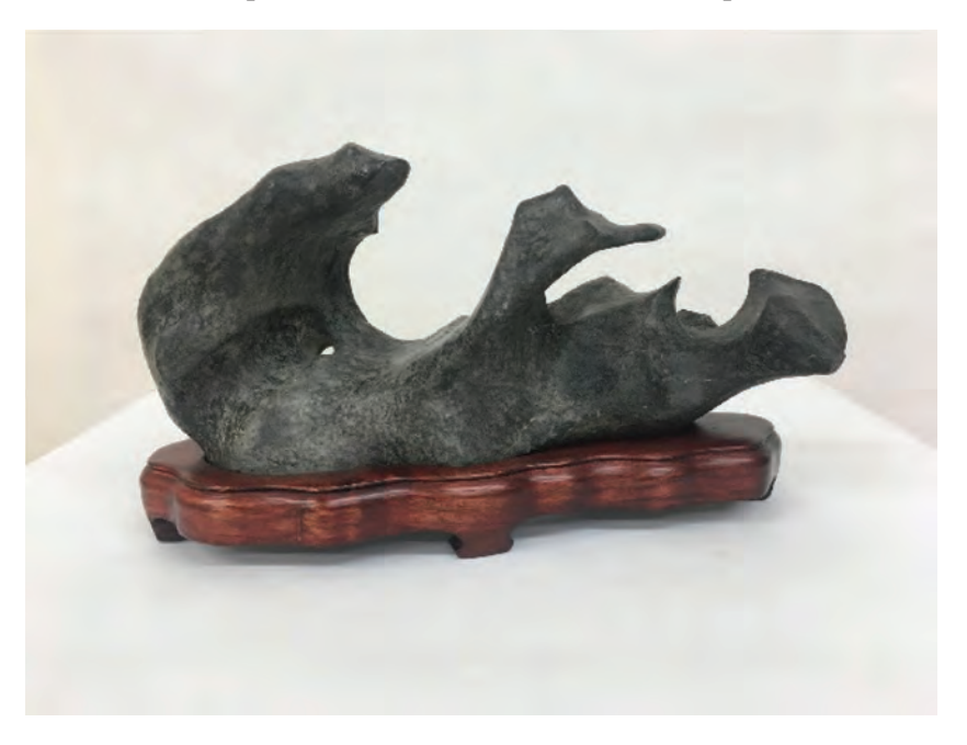
Lingbi stone, Kemin Hu Collection.

Rock collecting is a universal human pastime. Throughout East Asia, scholars have cultivated distinct traditions: in Korea, suseok (Chernick, 2020); in Japan, suiseki (Benz, 2001); in China, gongshi (Hu, 1998). The most prized "kernels of energy and bones of the earth" (Hay, 1985) were created by water or wind carving away the geological structure until only the essence of the rock is left behind. The stones became appreciated as an art form when they were enhanced by artisans, set into elaborately carved wooden bases or trays of sand and water, and brought indoors for contemplation. Daoist practitioners understood these unique stones as an index or a synecdoche of harmony with nature. As the stones were passed from generation to generation, they signified an authentic connection to the landscape and an aesthetic reminder of that spiritual connection.