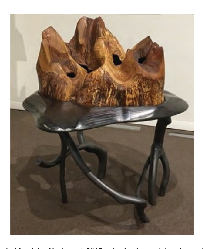
Andy Moerlein, Uncharted , 2017 red oak, plywood, beech, maple.