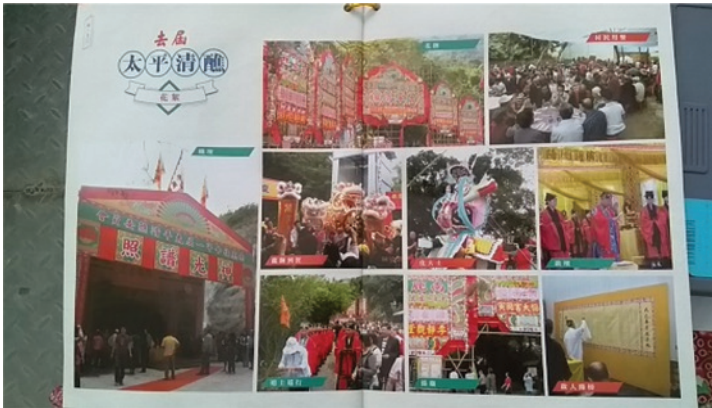
FIGURE 3 | Nam-Luk Coalition Da Jiu Festival booklet.