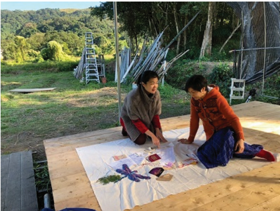
FIGURE 7 | Mapping on the platform.

Today I went to Tai Po Lam Tsuen with my empty silhouette. Lam Tsuen itself is not a village but a valley where 23 villages are scattered, along with five Weitou people's villages and 18 Hakka villages. Like other old villages in Hong Kong, most of the villagers had moved out to make a living in the urban area. A new generation of organic farmers, artists, and young intellectuals looking for a sustainable alternative have arrived as renters, forming a self-organized local economy and cultural network in the area. I met a few holistic wellness practitioners who have been witnessing the changes in the area for a decade. Since they have been involved in ancestral healing work, I thought it makes sense to explore the idea of decolonization and indigeneity with them.