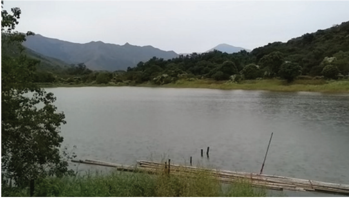
FIGURE 2 | Fish pond in Nam Chung.