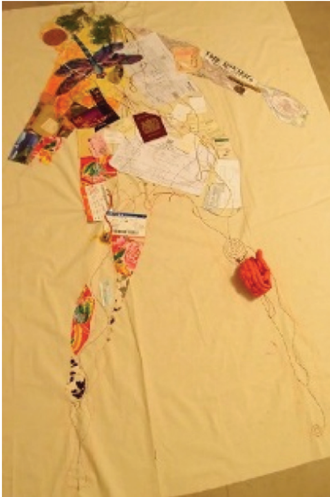
FIGURE 8 | Filled silhouette. 180cm ×130cm. Mix media. © Gracelynn Lau.