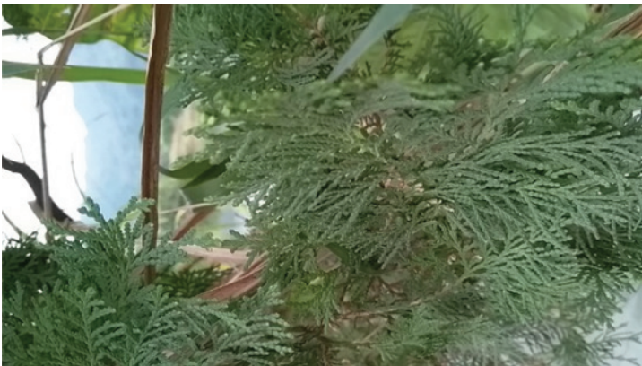
FIGURE 4 | Cedar found in Hong Kong.