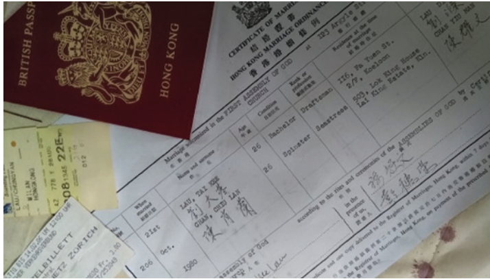
FIGURE 5 | My old Hong Kong passport and my parents' marriage certificate.