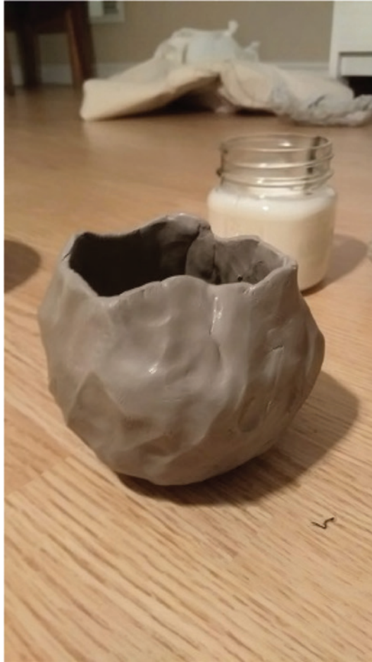
FIGURE 9 | Imperfect container. Clay.

Yung asserted that decolonization is repatriation of land and ways of being to indigenous peoples (Tuck & Yung, 2012). For non-indigenous people, “embodying decolonization” should mean actively showing up politically and culturally to say no to continuous colonization.