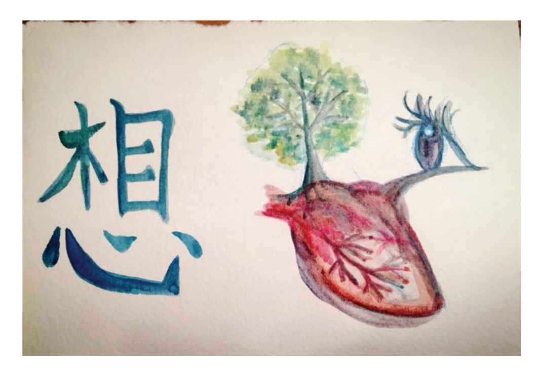
FIGURE 1 | "To think" in Chinese and its imagery.

The word "to think" (想) is composed of three parts: "a tree" (木), "an Eye" (目), and "a heart" (心). When I illustrated the word into the picture, suddenly I made sense of what I was looking for.