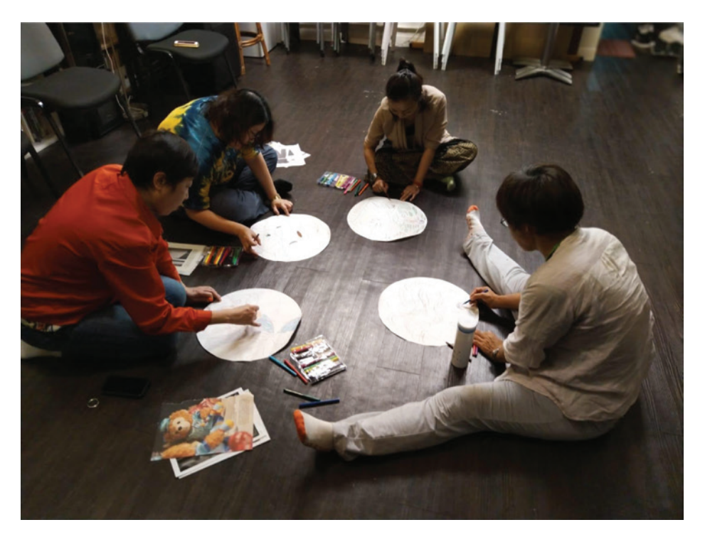
FIGURE 3 | Process of "Expressive Arts as Inquiry."

"But I noticed the change in myself after every session. After the first session, I experienced a relaxation in my brain. I have never experienced that lightness of my brain, like it doesn't need to work and is able to turn off some functions. The second session, I experience a different way of thinking in my head, like there are individual ideas popping up simultaneously, I found it difficult to handle because it is unfamiliar for me. This feeling gets better after the third session, when we have to perform an improvisational drama play. I was afraid and worried that I couldn't make it (the play). However, with your encouragement, as you said 'We already have the story inside.' I suddenly feel confident to do it, and the play actually helped me to connect those scattered ideas in my mind into something concrete."