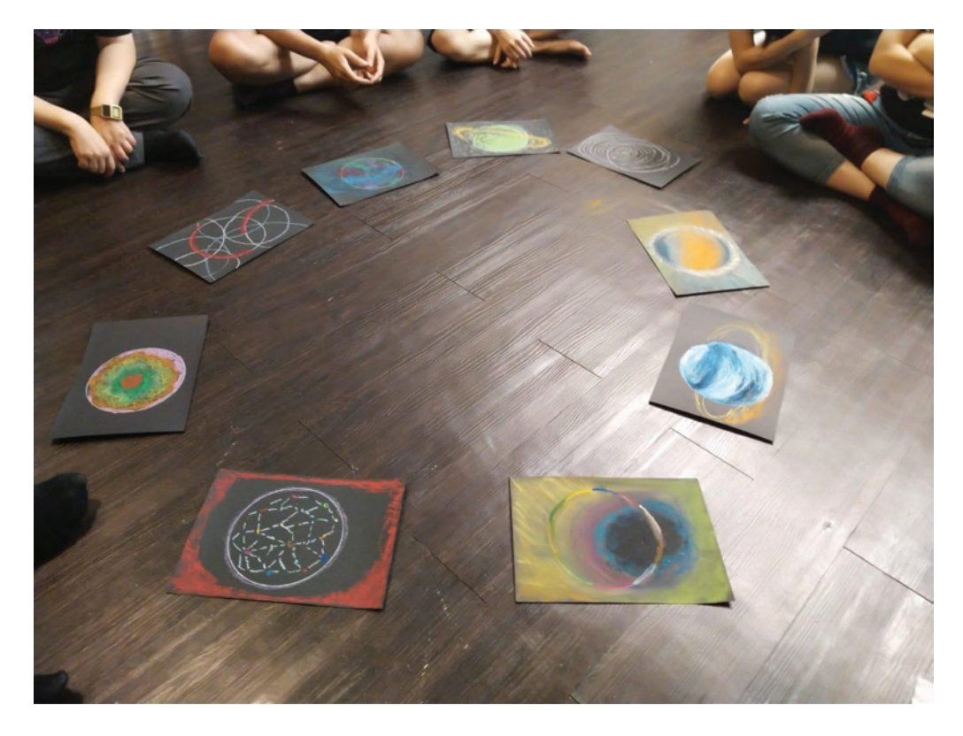
FIGURE 4 | Theme: "Star at Its Own Orbit" visual artwork.

Quite a few of the participants have the theme of "It's okay to stay in the chaos" and "It's okay to be tedious" as the name for their "star." This theme reminds me of another concept in Taoism wuyong (無用), which means "purposiveness without a purpose" by Zhuangzi. I am surprised that this theme emerged at this time to show the contrast against mainstream society's singular definition of success, which is being purposeful and useful (有用). It is a powerful but essential discovery. The artwork reminds us again about the importance of art, creativity, imagination, and intuition. All of those are part of our human nature and the resources we can use to restore capacity in our human mind in order to see things clearly with new perspectives.