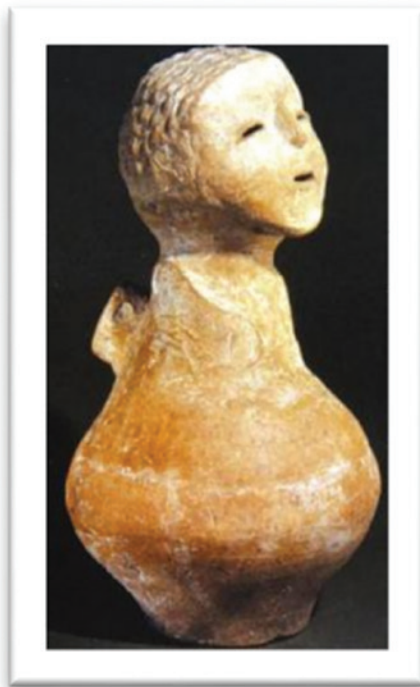
FIGURE 2 | Sheep-shaped pottery from the Yangshao Cultural Site. https://news.gujianchina.cn/show-3764.html .

The reason why we encounter something that is not “beautiful” today is that some people just want to “use” and discard the original business attitude of why people are “beautiful”. Meanwhile, the word “beauty” also explains that sheep has a close relationship with human daily life since the ancient times. It is a common and prolific animal in human life. Its meat can be eaten and its fur can be used to protect against cold. Early humans killed it, eat it, and use it, but they do not forget to be grateful for it. Our ancestors worshiped the sheep as a totem worship. Aside from the sheep-shaped pottery unearthed from the Yangshao Cultural Site (Figure 2), our ancestors also used it as a sign of beauty and dress themselves up with it, much like what we call fashion today. We have to admire how noble and sacred this primitive pragmatism and attitude towards animals are. We have to admire this primitive pragmatism and the attitude towards animals, which is noble and sacred human behavior. It’s a shame.