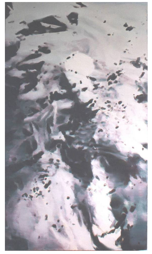
Creative Arts Educ Ther 2016, 2(1)