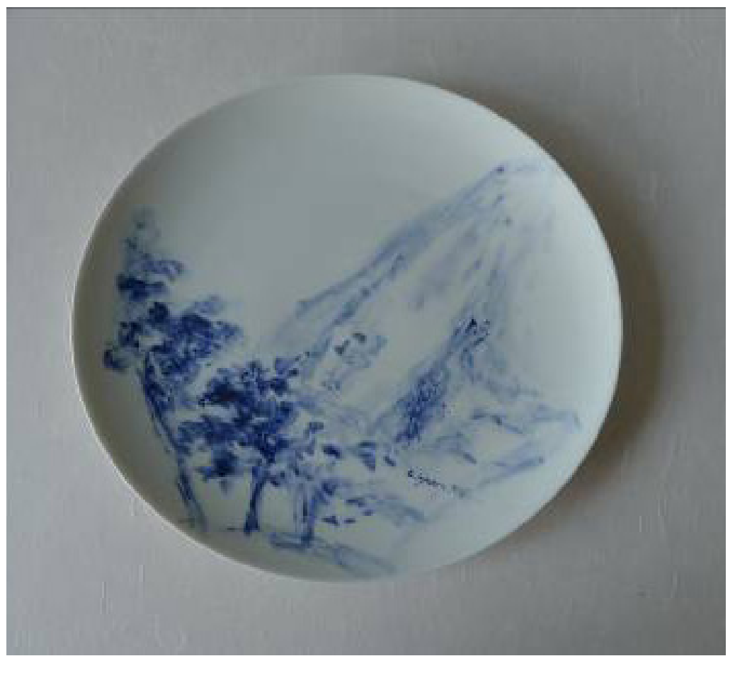
Copyright © 2016 Inspirees International/Quotus Publishing