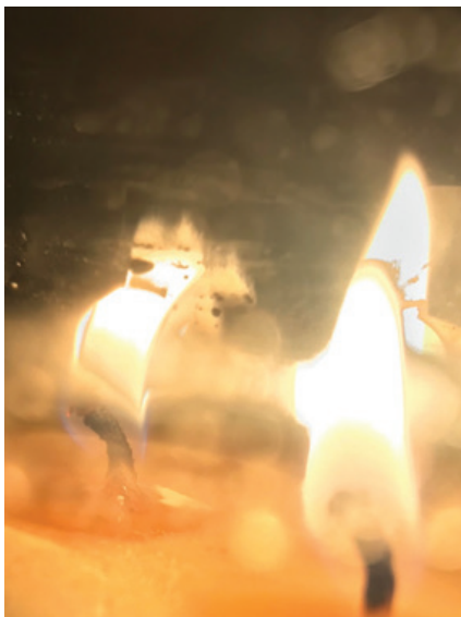
FIGURE 3 | Ariel Moy, 2018, A collection of candle-less flames known as Intersubjectivity (photograph)