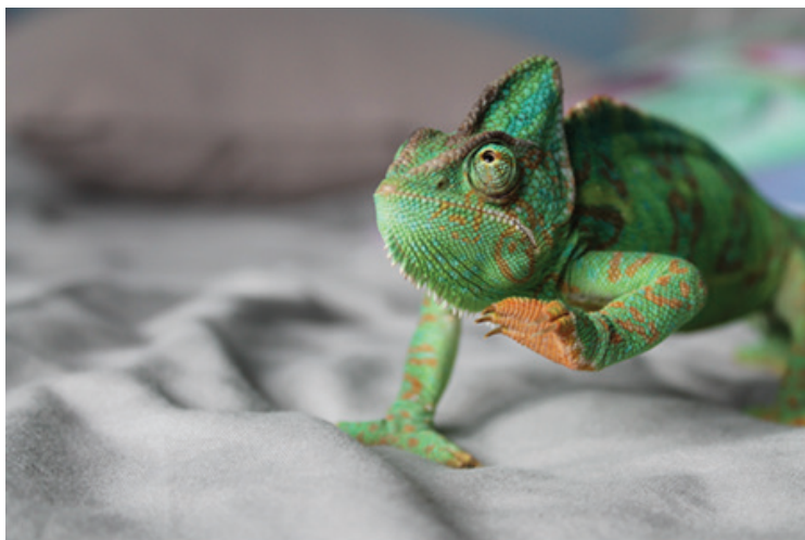
FIGURE 4 | Cécile Brassuer, 2018, A chameleon known as Multimodality (photograph), sourced from unspashed

Values: We are powerful – we are the axiology that has given form to your ontology (yes, the radical intersubjectivity) and to your epistemology (that focuses you on the moment to moment multimodal experiences of coming to know).