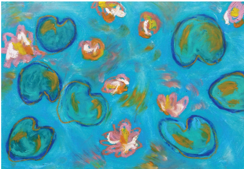
FIGURE 4 | Exploring place – Lily pond. Oil pastel on paper. Ange Morgan, 2016