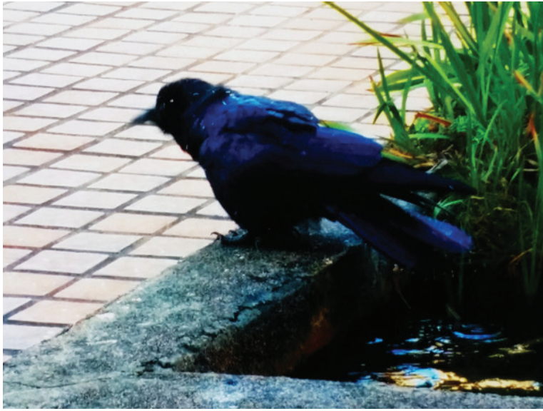
FIGURE 5 | Exploring place – Crow. Photograph. Ange Morgan, 2016