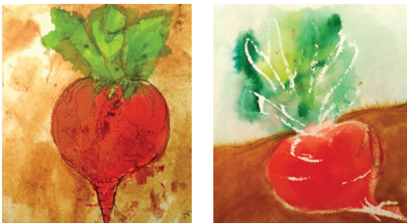
FIGURE 10 | Figurative work in studio art therapy – Making work with clients. Ink, watercolour, wax and pen on paper. Ange Morgan, 2018