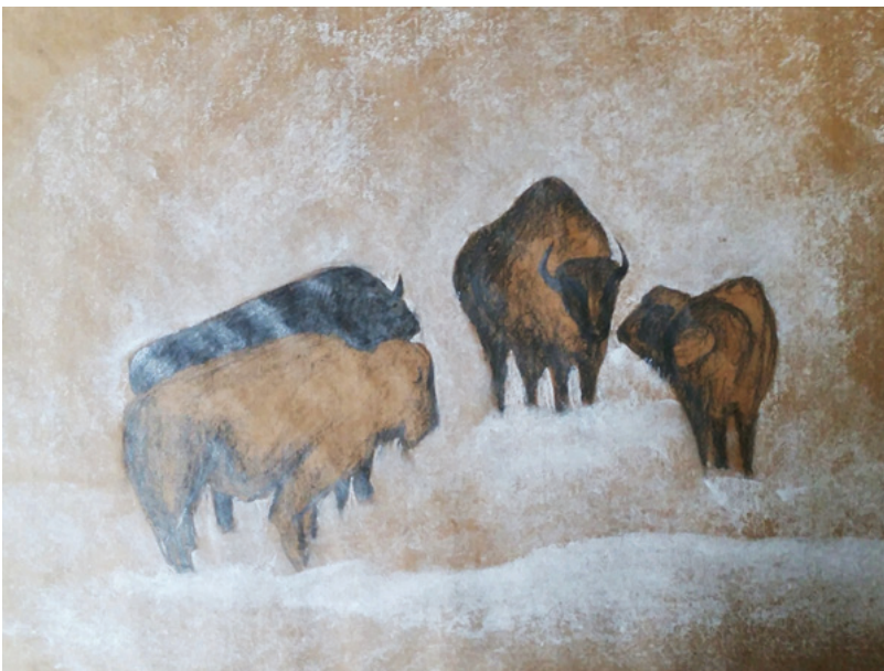
FIGURE 6 | Bison. Graphite and chalk on paper. Ange Morgan, 2017