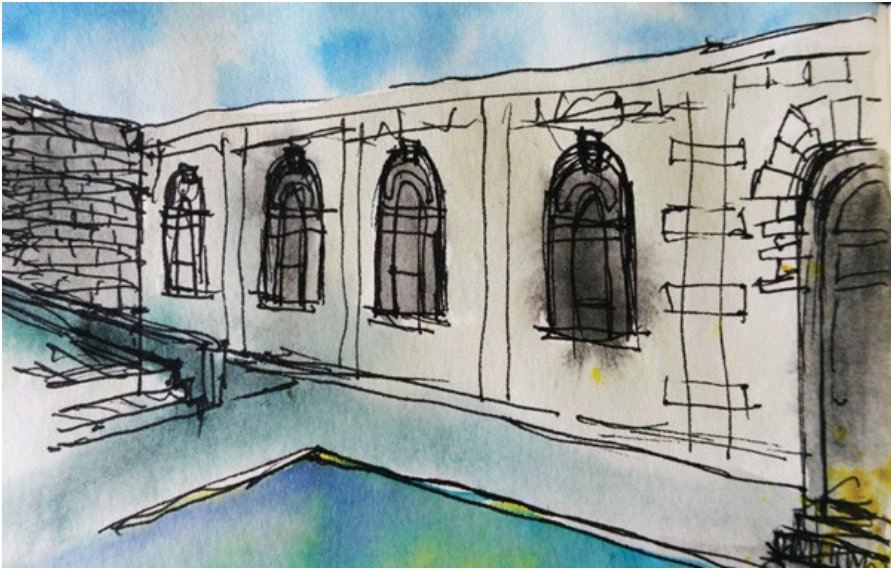
FIGURE 1 | Reflective space – Church grounds. Pen and watercolour on paper. Ange Morgan 2016