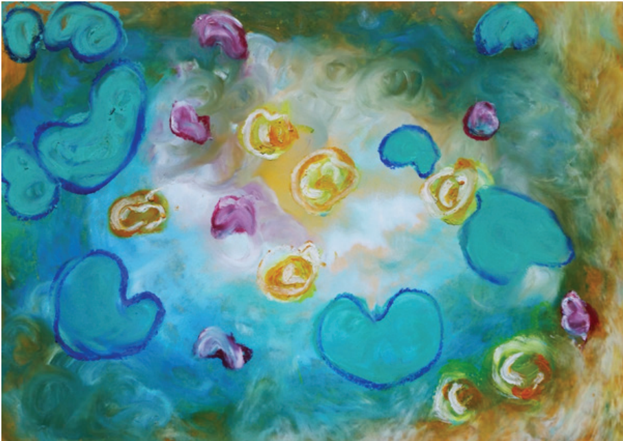
FIGURE 3 | Exploring place – Lily pond. Oil pastel on paper. Ange Morgan, 2016