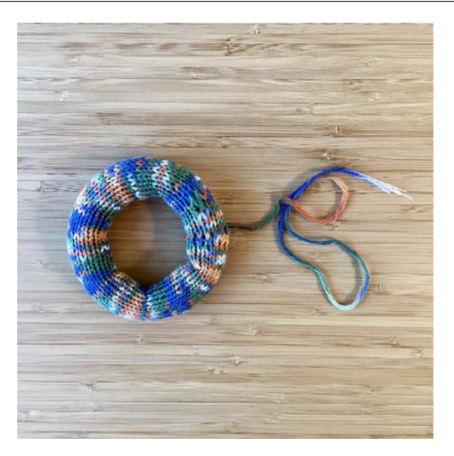
FIGURE 4 | Marta Callizo, ISR for "Demiurge" (final iteration), 2017, (knitted piece)

circular shape. It also had to be three-dimensional and constituted by the sum of multiple small elements (stitches). The addition of stitches would create the whole. These elements had to reflect diversity – expressed by shades of different colours – but also show rhythm and structure.