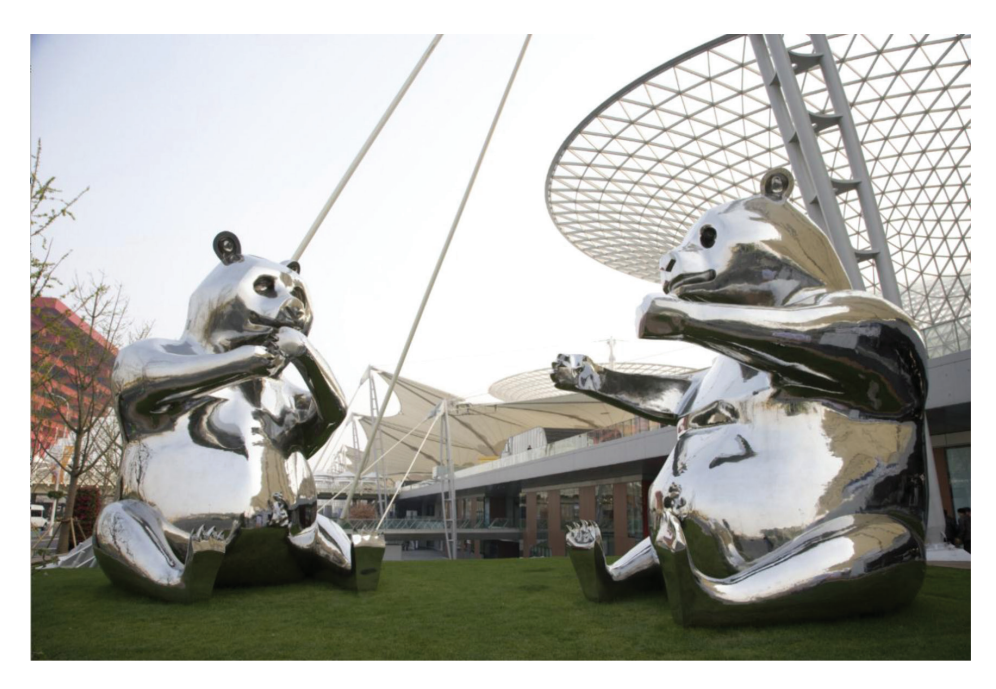
FIGURE 3 | HeheXiexie: 2010, Mirror Finished Stainless Steel. Left: 600 x 420 x 380 cm. Right: 600 x 426 x 390 cm. Permanently Reserved in Shanghai Expo Site. Courtesy of Zhang Huan Studio