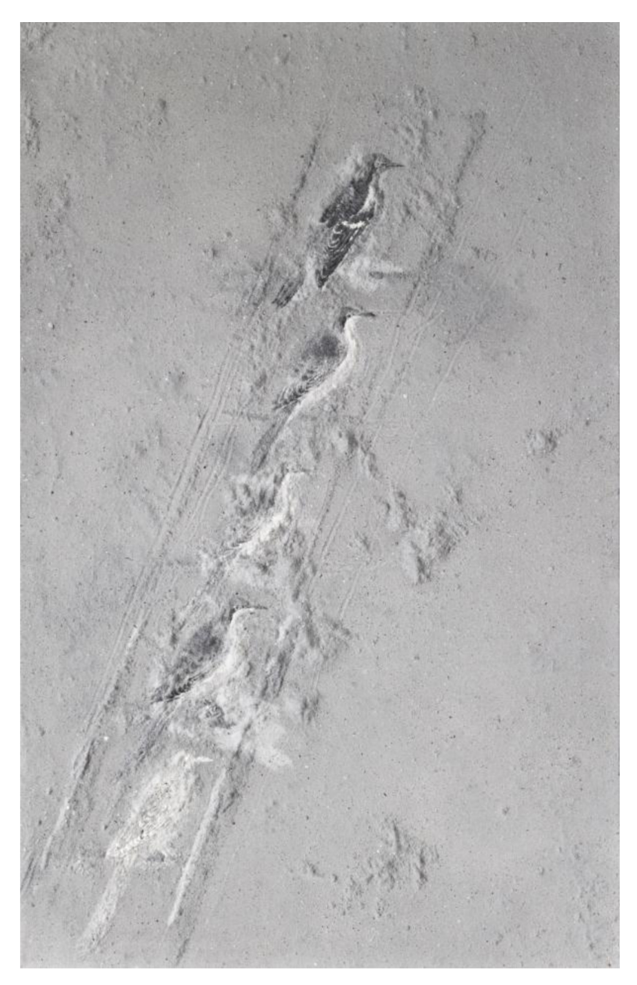
FIGURE 5 | Forgetting Sorrow No.6: 2012, ash on linen, 250x160cm.