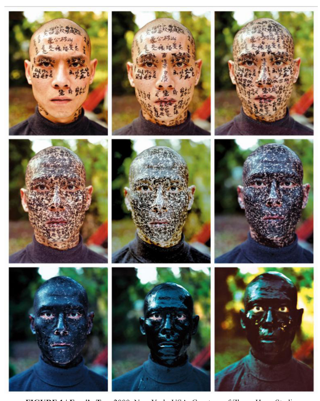
FIGURE 1 | Family Tree 2000, New York, USA, Courtesy of Zhang Huan Studio

attitude by which humankind has conquered nature – even reflecting deeds of volition and hope.