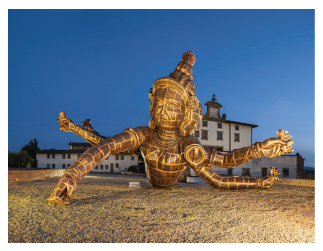
FIGURE 2 | Three Heads Six Arms: 2008, Steel and Copper, 315 x 709 x 394 inches (800 x 1800 x 1000 cm) Forte di Belvedere, Florence, Italy.

this represents the shared aspirations of people from all over the world. In honor of the Shanghai World Expo 2010, this piece of work is a permanent public sculpture.