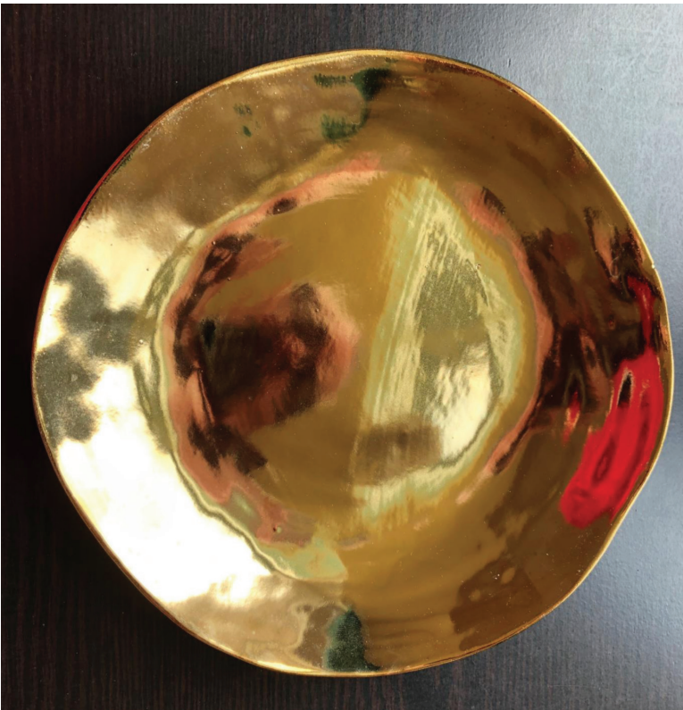
FIGURE 1 | R. Lay, Self-Portrait in Singapore 2019 , 2019, digital photograph (cropped)